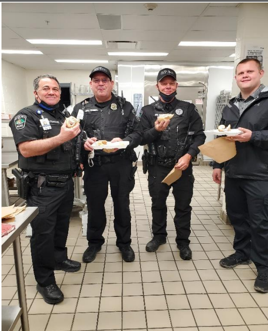
New SRO getting a tour of Scott HS!